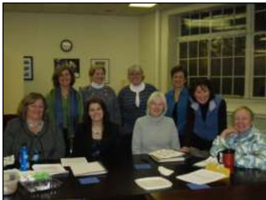
Members of the HFHNCM Family Selection Committee do their very important work.

If you have experience or expertise in one of our committee areas and would like to help or just want to get involved with Habitat at a more foundational level, contact the Volunteer Services Manager at 978-348-2749, ext. 205.