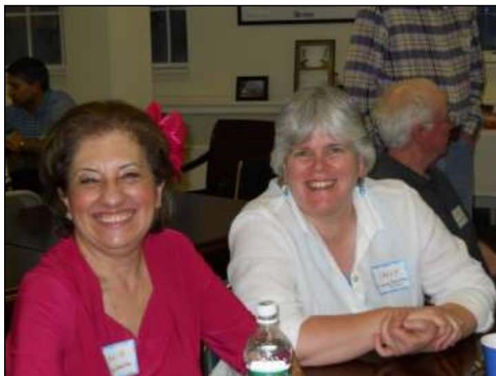
HFHNCM Volunteers enjoy the Volunteer Pot-Luck Supper

ReStore Volunteer orientation sessions will take place on the first Monday of each month at 10:00am and the third Friday of each month at 5:30pm. Both sessions will be held at the ReStore and will last approximately one hour. Come see the store, meet the staff, find out what there is to do and how you can get involved!