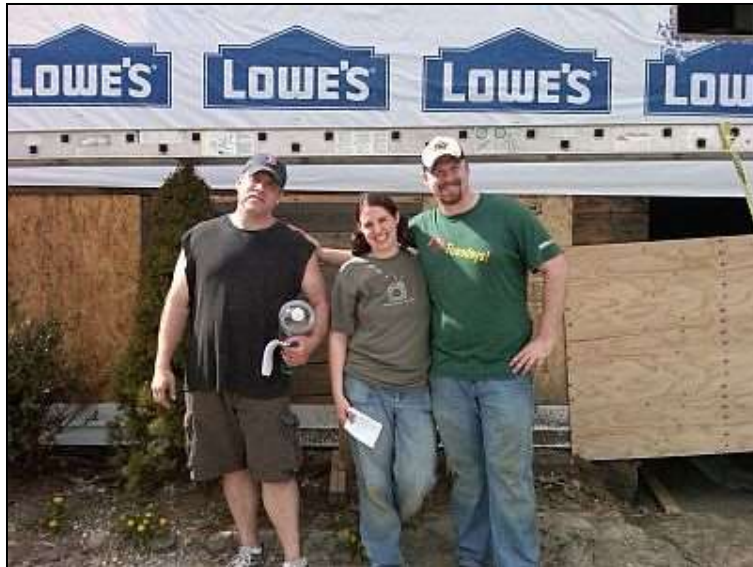
Construction Volunteers enjoy their day wit Habitat in Lancaster.

School and Court-Ordered Community Service Information: HFHNCM tries to accommodate requests for community service hours as much as possible. Letters verifying the hours completed can be picked up from the HFHNCM office by appointment. Please be aware: We cannot accept court-ordered community service requests from persons whose offences involve larceny and/or violence.