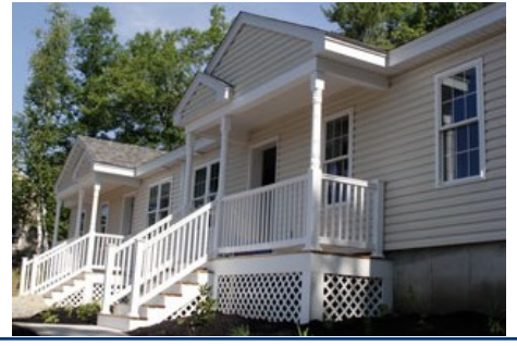
The Stow duplex will be similar to these homes on Central Ave in Ayer.