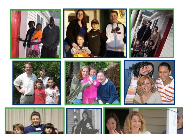
These families come from Ayer, Hudson, Acton, Groton, Fitchburg, and Littleton.

Habitat homeowners are selected on the basis of need, ability to pay, and willingness to partner through sweat equity hours on the construction of their homes. Homes are constructed primarily with volunteer labor. They are sold to families at no profit, with a zero interest mortgage. Mortgage payments are recycled through a local Fund for Humanity to build additional homes. In this way, your support for the Stow project goes so much further than helping two families. You are part of transforming neighborhoods and towns for generations to come.